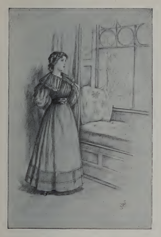
"POLLY ... STOOD AT THE FARTHER LIBRARY WINDOW